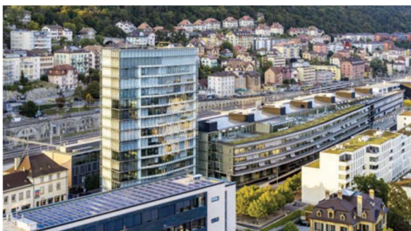
The FSO is situated in Neuchâtel and attached to the Federal Department of Home Affairs.

Since 1989, the FSO has had its own cartographic service – ThemaKart – that offers a competent and fast cartographic information service for institutional customers and is the centralised production unit for all FSO's map and atlas products.